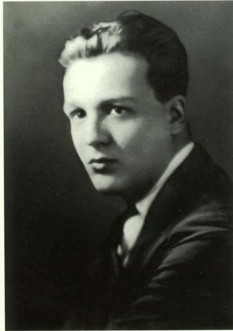
Stanley G. Weinbaum